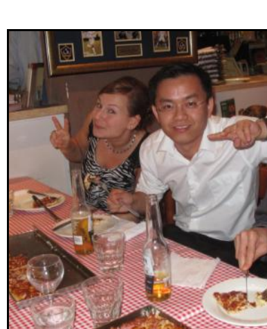
Two of our Brisbane interns having Pizza at Park Road in Milton.